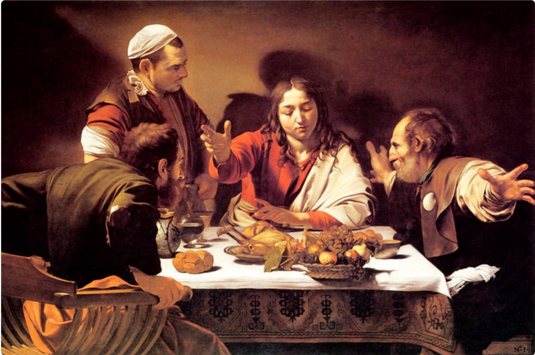
The Supper at Emmaus by Caravaggio National Gallery, London, UK